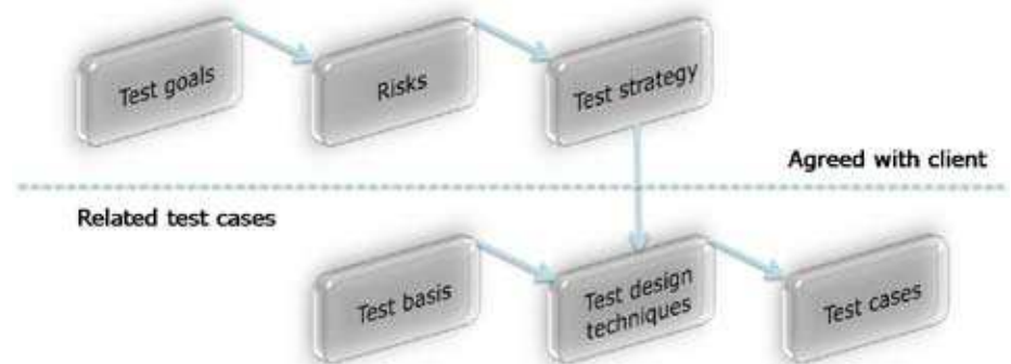
Figure 1: From test goals to test cases

The quantity and abstract nature of techniques is an important cause of their being 'unloved'.